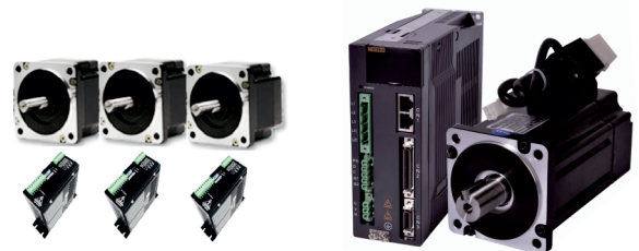
Servo - Stepper Motors and Drivers