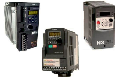
Spindle Drives (inverters)