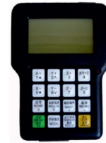
DSP Handheld Terminal