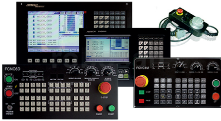
CNC Control Units