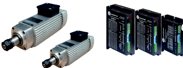
Spindle Motors and Drives